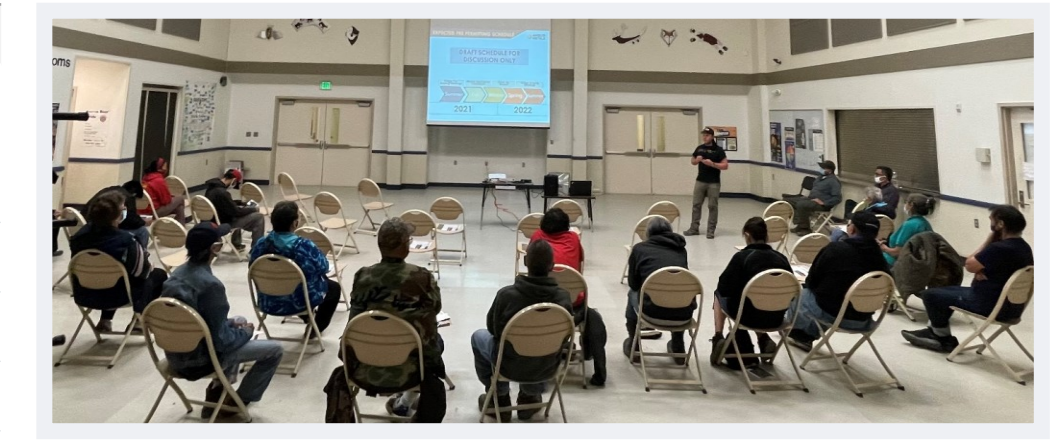
Community meeting in Noorvik, August 11, 2021